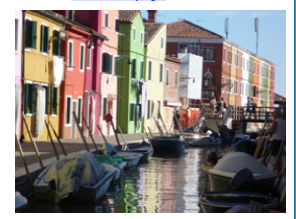
Do you know where this is?

Send your answer with the reference "August newsletter" to the EAHC-BTSF-PROJECTS@ec.europa.eu and participate to win BTSF USB key card.